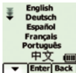
Fluke 568 Ex