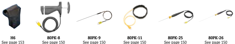
H6 See page 153 80PK-8 See page 150 80PK-9 See page 150 80PK-11 See page 150 80PK-25 See page 150 80PK-26 See page 150